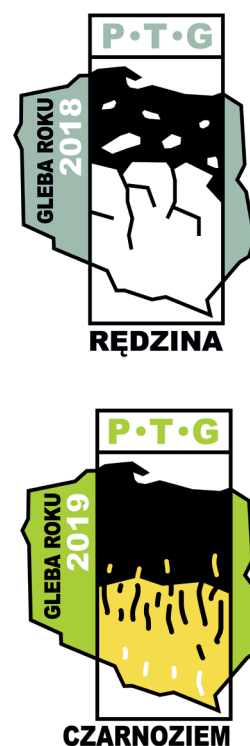
Figure 1. Logos of “The Soil of the Year 2018 and 2019”

While pedology knowledge is frequently promoted abroad (e.g. in Scotland: http://www.hutton.ac.uk/learning/dirt-doctor ), in Poland similar endeavors have only started in recent years. The efforts include the website of the Soil Education Committee of the Polish Society of Soil Science ( https://sites.google.com/site/edukacjaoglebawawstwa/ ) as well as Facebook site of the Center for Soil Education – Soil Museum ( https://www.facebook.com/Centrum.Edukacji.Gleboznawczej.Muzeum.Gleb/ ), which contains didactic ideas and links to documentary films. An example of a campaign aimed at popularizing and educating in soil knowledge is “The Soil of the Year” initiated in 2018 by the Polish Society of Soil Science. Rendzina was selected the soil of 2018 and Chernozem of 2019 (Fig. 1).