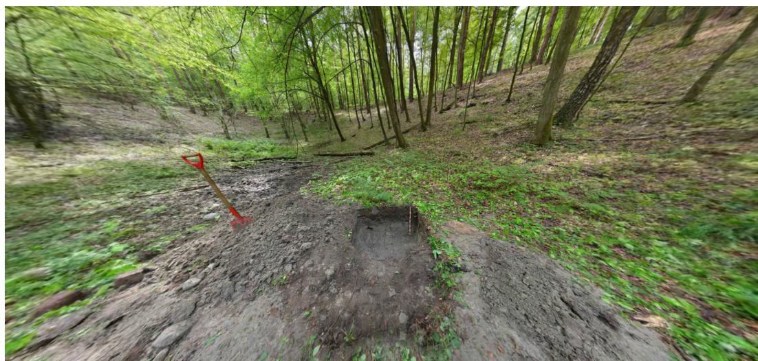
Figure 3. Example of a spherical panorama taken from the soil base – developed as part of the FACES project (Gleyic Umbrisol from Brodnica Lake District)

Spherical panoramas are a considerably valuable element of the portal. These are photographs depicting the landscape (surroundings), within which the soil profile was made. They give the opportunity to view the area in a 360 degree perspective. This provides a direct