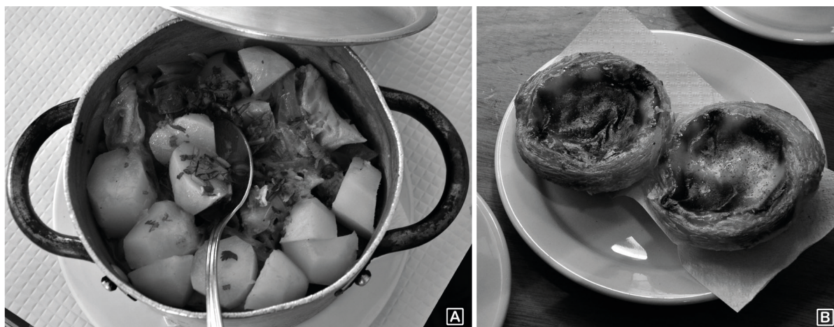
Figure 1. Portuguese dishes: [A] caldeirada ; [B] pastel de nata

Estremadura is a seaside region where the capital of Portugal, Lisbon, is located. The cosmopolitan city has an easy access to dishes from other regions and those which came from ex-colonies. Bacalhau or sopa de pure de mariscos – minced seafood soups are typical fish and meat dishes of the region and popular in the whole country. The grilled sardines – sardinha assada are thought to be the local specialty. The province Estremadura is situated along the peninsula north of Lisbon. It delivers all the necessary cooking ingredients to the capital city. The most significant accent of the regional cuisine, known in the whole Portugal, is piri-piri – spicy sauce made from malaguetta peppers, which used to be imported from colonies. In the cafes ( pasticcerii ), the popular cheese cakes from Sintra are sold ( Queijadas de Sintra ). Pasteis de feijau and pastel de nata in