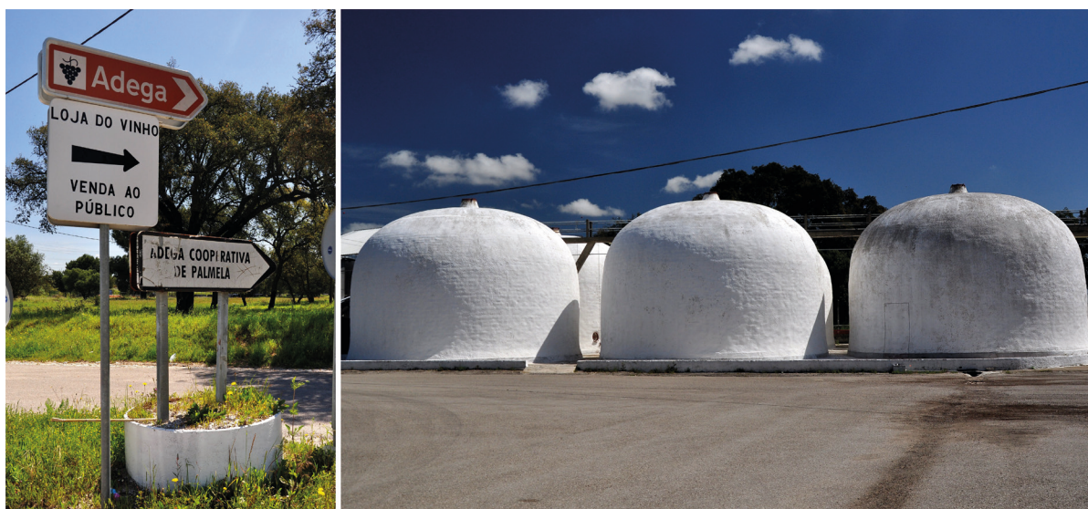
Figure 4. The Adega Cooperativa de Palmela founded in 1958

in the fifteenth century when the island was discovered by João Gonçalves Zarco. Currently, the Madeira wine is made from such varieties as: sercial , verdelho , boal and malvasia . The flavour of Madeira wine depends on the variety. It is the only wine that is the result of a long sea voyage in the tropical climate. Its major characteristic is storing at a temperature of 45°C in tanks called estufas . It is then amplified with distillate and consequently contains from 19 to 22% of alcohol, which is similar to the process of porto production.