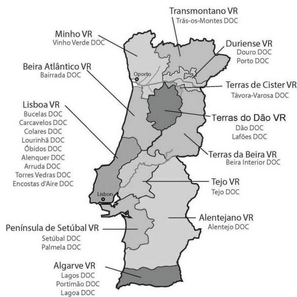
Figure 2. Major Wine regions and D.O.C.'s in continental Portugal

The Douro Valley is the oldest wine region in the world covered by the appeal D.O.C. It is situated 100 km from the Atlantic coast into the hinterland and stretches up to the border with Spain. The area of vineyards stretches in