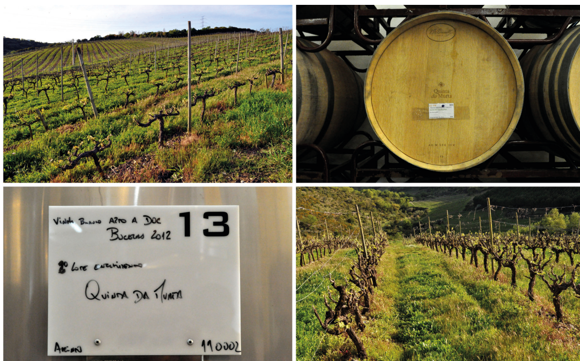
Figure 3. Quinta da Murta vineyard, Bucelas. A 27 ha wine estate, located 25 km north of Lisbon