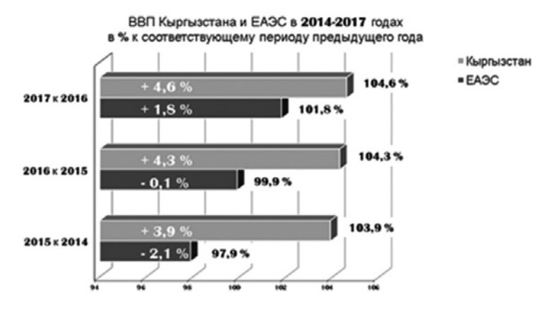
Figure 2. The GDP of the Kyrgyz Republic in 2014–2017

Kyrgyzstan is one of the leaders in economic growth among the EAEU countries according to Arzybek Kojoshev, the former minister of economics of the KR (Kojoshev, 2018). He also added that the inflation rate for the three-year period in the EAEU did not exceed 5%. The positive dynamics of economic growth in 2015-2017 (average 4%) is another good indicator. The growth of turnover during this period was 15% and the garment industry was developing at especially fast pace.